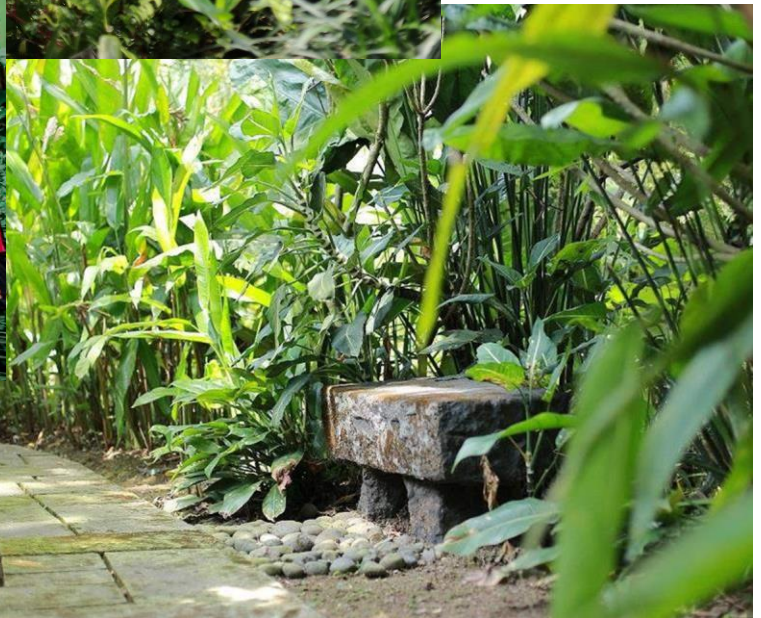
Exploring The Natural Fiber Park of Indonesia