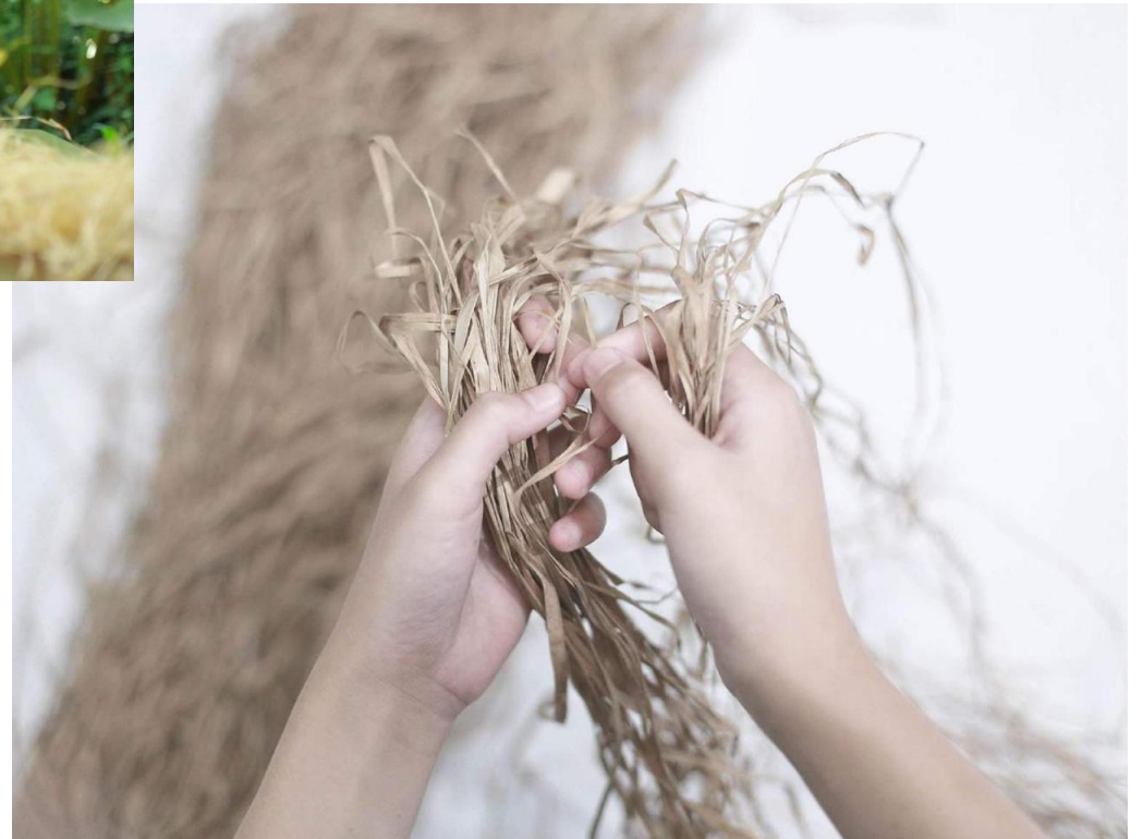
Learning to Splice Fiber