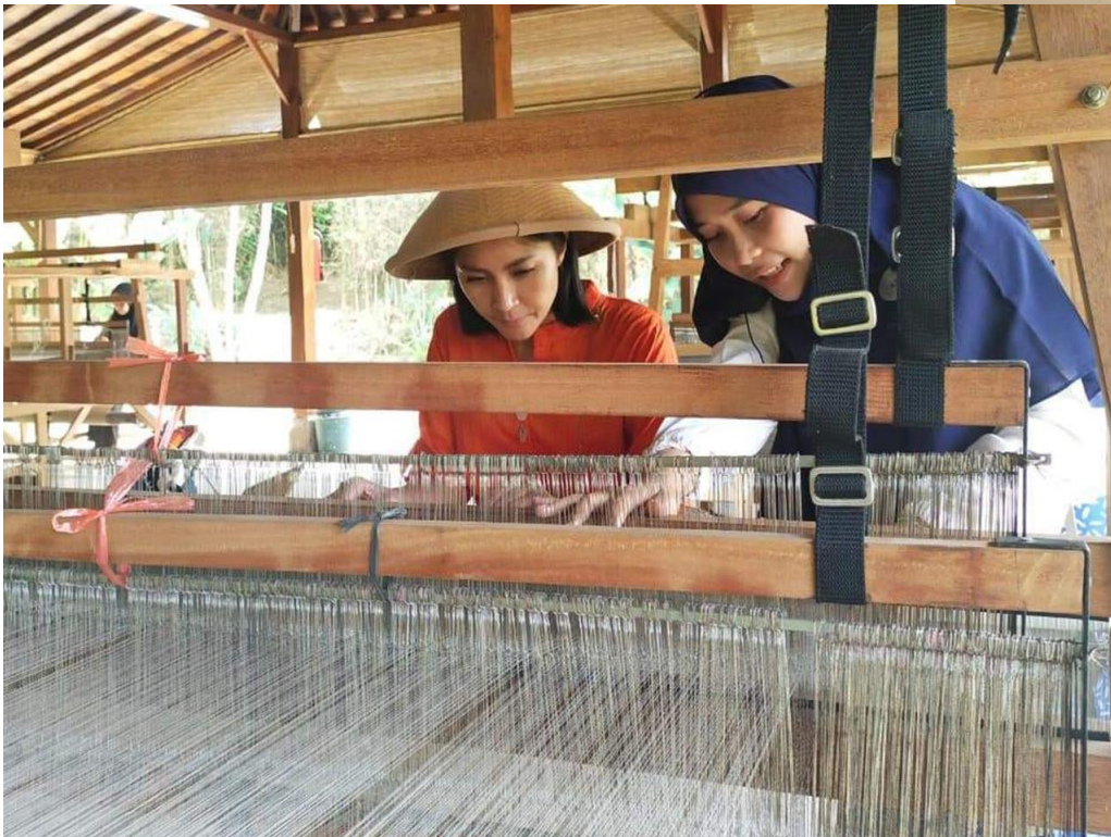
Learning to Weave